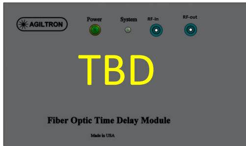
Front Panel (TBD)

Typical 6U 19" rack for 16-19 bit system with the maximum delay of 0.1ms.